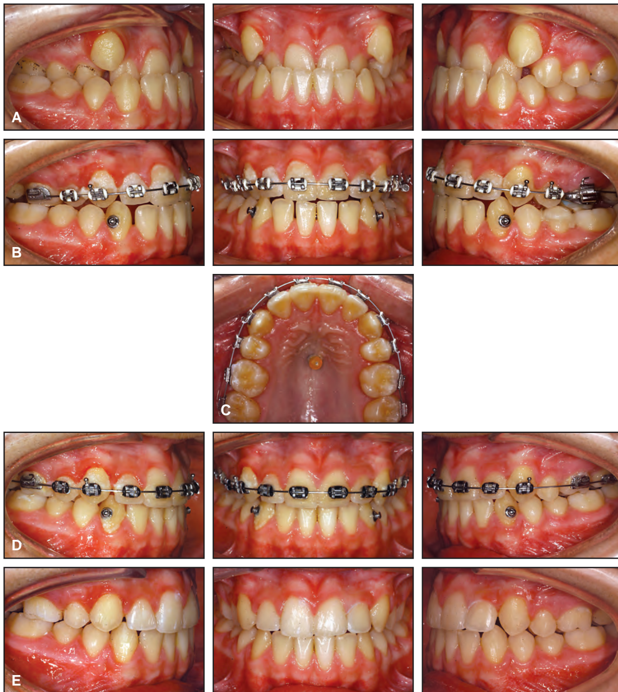
Fig. 5 A. 13-year-old male patient with anterior crossbite treated with maxillary fixed appliances and Class III elastics. B. After correction of crossbite, patient exhibited open bite and lower spacing from low tongue position. C. MIP 2 placed in palate for tongue reeducation. D. Three months later, bite and diastemas closed without use of elastics. E. MIP left in place for four months after removal of appliances.