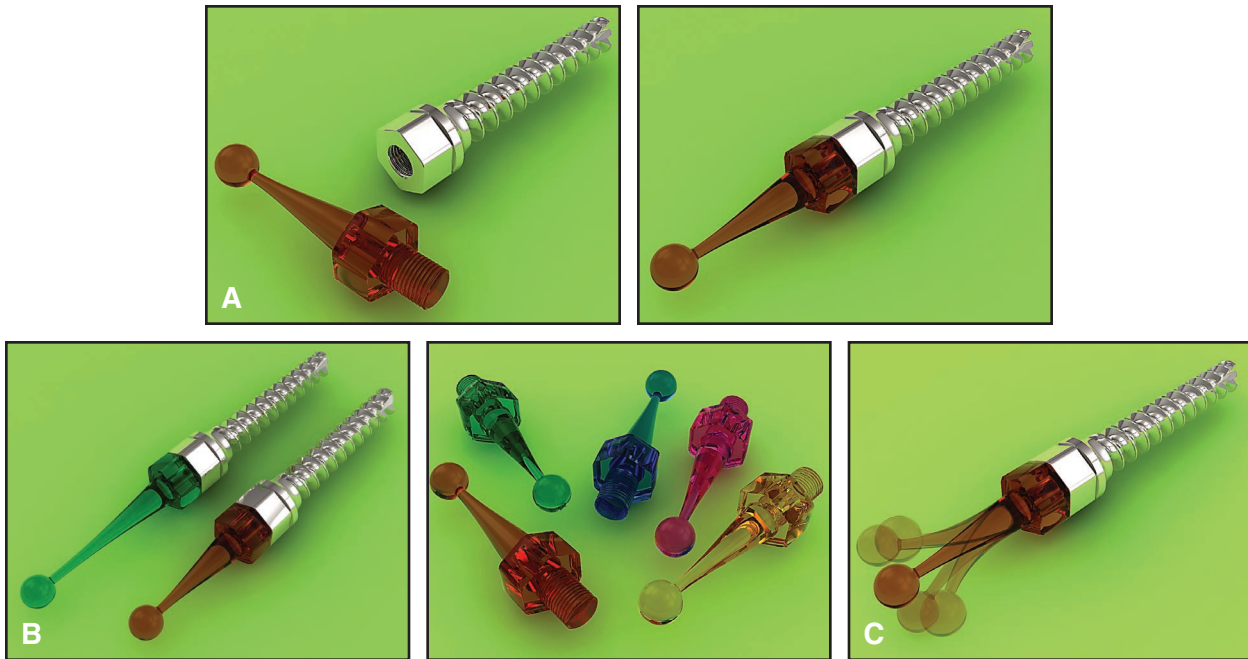
Fig. 2 A. Prototype of MIP 3, or “tongue joystick” system, providing greater elasticity and freedom of movement. B. MIP 3 in different lengths and colors. C. Possible range of motion.