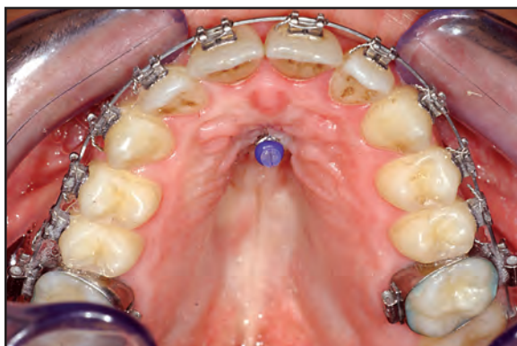
Fig. 4 MIP 2 with nylon screw fixing Pearl in cap of joint-head mini-implant.

of the patient's low tongue position (Fig. 5B).